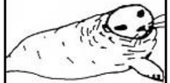
No. Elephant Seal