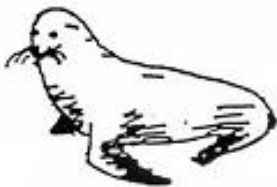
CA Sea Lion