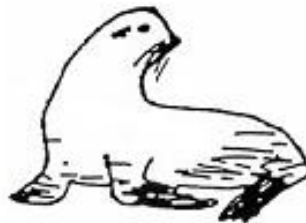
Northern Fur Seal